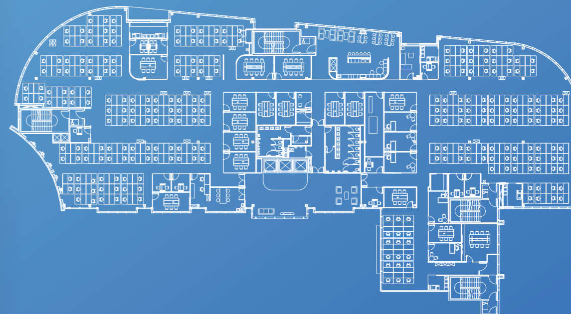
SECOND FLOOR 26,609 SQ FT / 2,4772 SQ M GIA